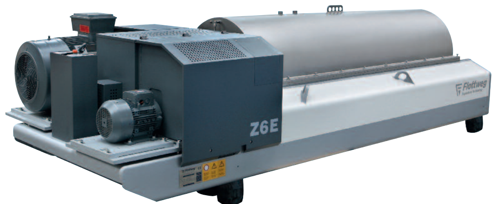
TECHNICAL DATA FOR THE FLOTTWEG SURIMI DECANter